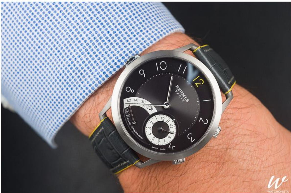
Hermès Slim d'Hermès l'Heure Impatiente for Only Watch 2017