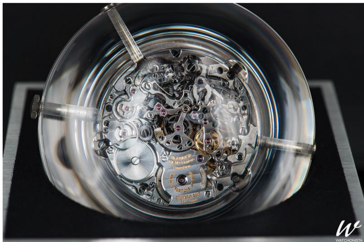
Agenhor X Head Carpe Diem for Only Watch 2017