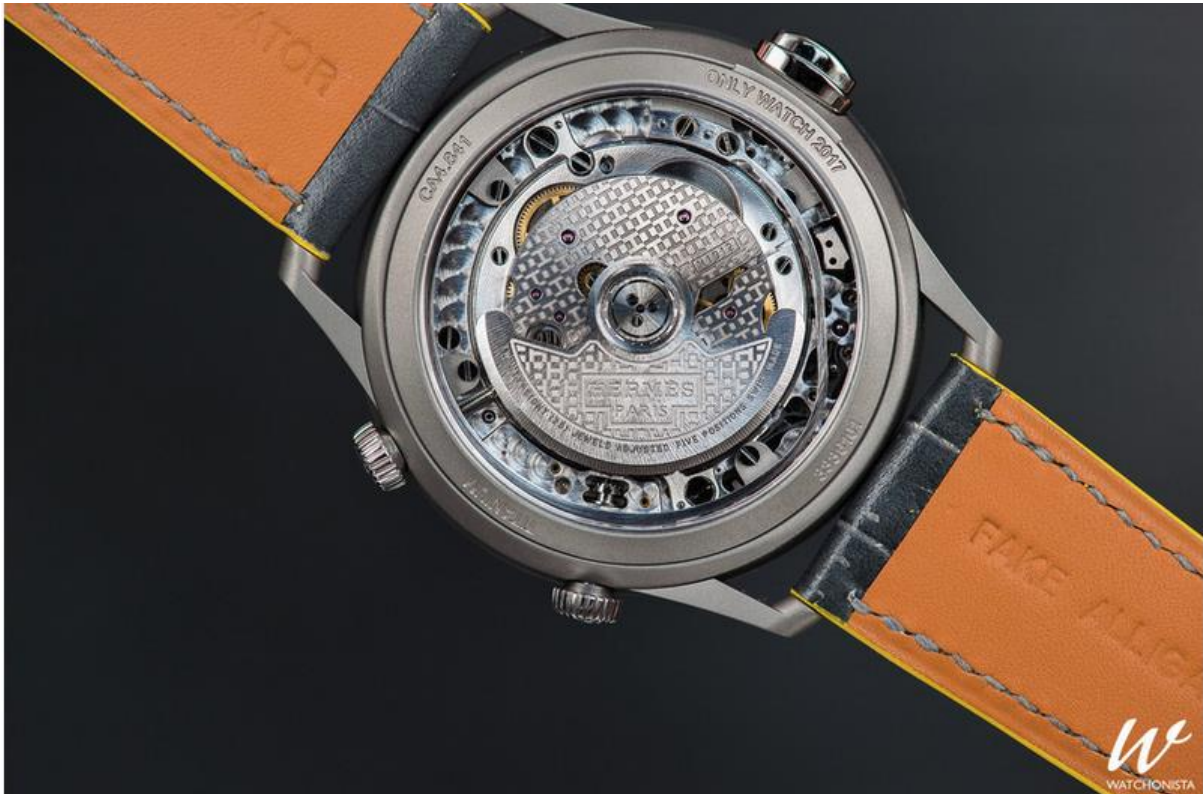
Hermès Slim d'Hermès l'Heure Impatiente for Only Watch 2017

After unveiling the Arceau Le Temps Suspendu, Hermès went on to offer playful ways of delivering time. In 2017, the model emerged in a variation called l'Heure Impatiente. The Manufacture Hermès movement H1912 inside is a compact device with a special module added. Twelve hours before an important event, the wearer can program a countdown that will start sixty minutes before the start of said event. And time then ticks away at a painfully slow rate – you can watch it go by, in reverse, in a separate dial located between 7 and 6 o'clock. At H-hour, a bell rings, a single, held, velvety note. This Hermès watch has been done up in the black and yellow of Only Watch, that is titanium for the case, with the yellow being the alligator leather of the strap.